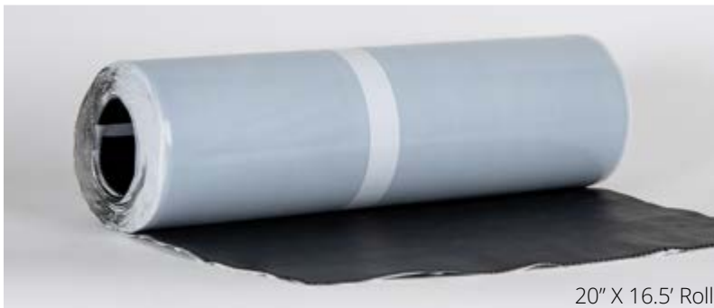
20" X 16.5' Roll